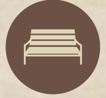
SENIOR CITIZEN SIT OUTS