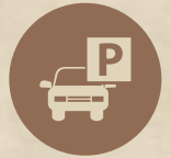
TWO LEVEL PARKING