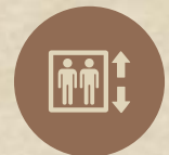
2 AUTOMATIC ELEVATORS