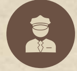
24 HOURS SECURITY