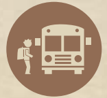
CHILDREN DROP OFF ZONE