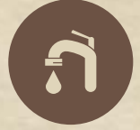
24 HOURS WATER SUPPLY