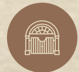
DECORATIVE MAIN GATE