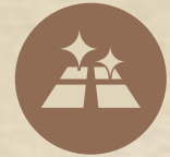
INTERNAL PAVED AREA